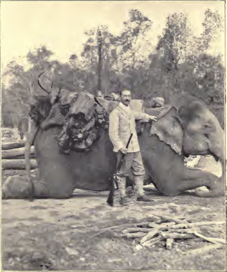
A KNEELING ELEPHANT.